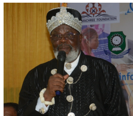
The King of Ke Kingdom, HRM, King Angolia Aboko Omoni , delivering his goodwill message