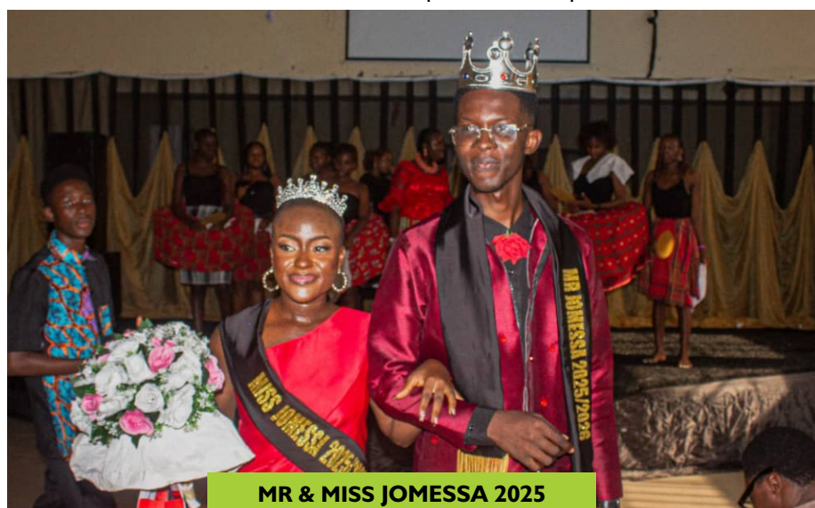
MR & MISS JOMESSA 2025

In conclusion, the JOMESSA 2025 Star Power Explosion was indeed a resounding success, showcasing the talents and creativity of students while promoting unity, celebration, and professional exposure.