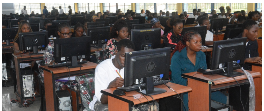
A cross section of candidates writing the Computer-based Post UTME

The Post UTME exercise is ongoing in an orderly manner, with the University remaining committed to a transparent and credible admission process.