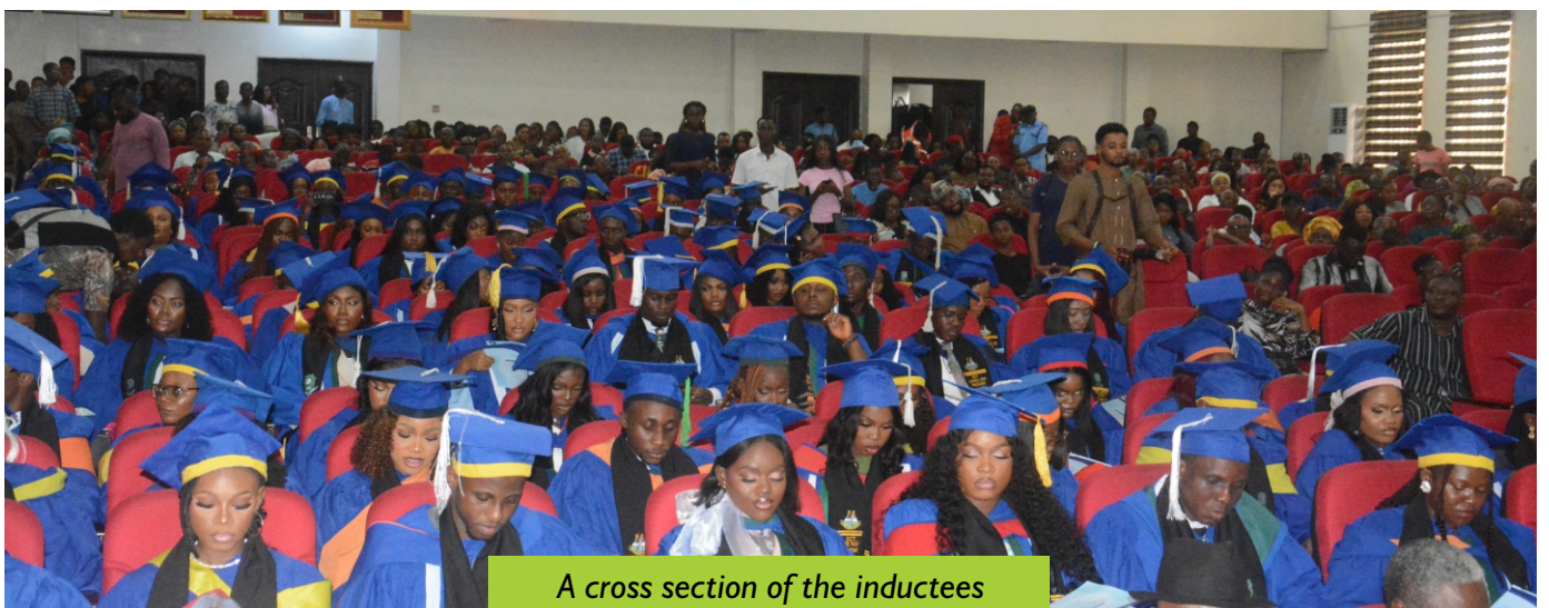
A cross section of the inductees