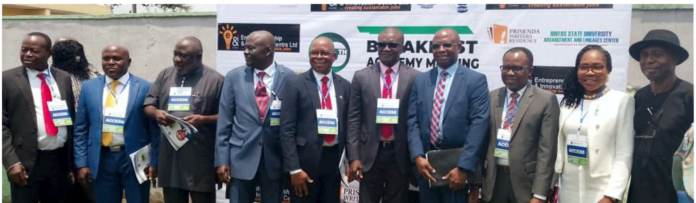
The Guest Lecturer with some participants shortly after the meeting

Collaborators", underscored the urgent need for regional and state-level collaboration to produce locally relevant solutions, especially in a country like Nigeria that traditionally depends on foreign technologies and products. He recalled that the founding vision of the then Rivers State University of Science and Technology (now the Rivers State University) was to position Rivers State as a centre of excellence in science and technology a vision that can only be realised through innovation and strategic partnerships with industry.